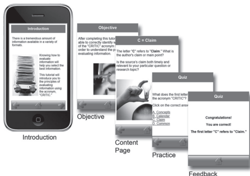
Figure 2. Screenshots from the How to Evaluate mobile instructional module

download speed was not compromised. A student commented “I don’t know that you’re going to be able to do a lot other than just quick reference job aids...I would think that job aids and things that you can learn quickly are the realm of smart phone development.”