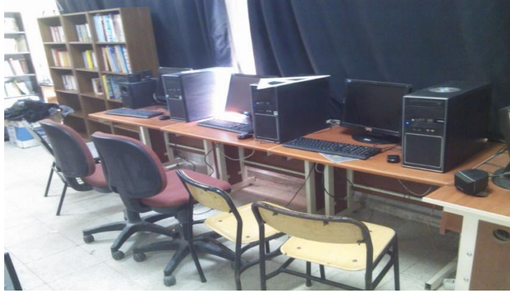
Figure 1. A Photo Taken in the Computer Laboratory